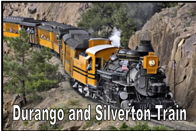
Durango and Silverton Train

and the Sandia Mountains form a beautiful backdrop to the area. The word “Sandia” means watermelon in Spanish and the mountains glow a watermelon pink at sunset. The city will be filled with tourists in town for the 2018 Albuquerque International Balloon Fiesta and this evening we will attend the Balloon Glow followed by a spectacular fireworks display.