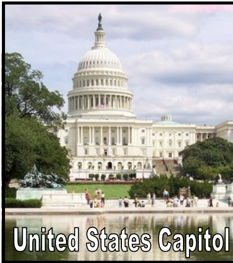
United States Capitol