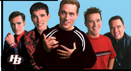
the Hughes Brothers